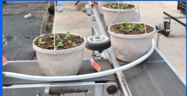
OUTSIDE CORNER KIT