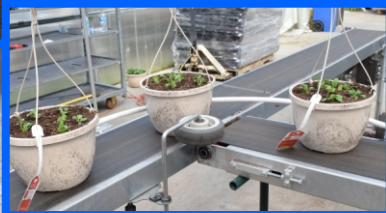
INSIDE CORNER KIT

We offer several ways to move product around the corner, each with its own set of benefits. Easy set up makes for improved productivity!