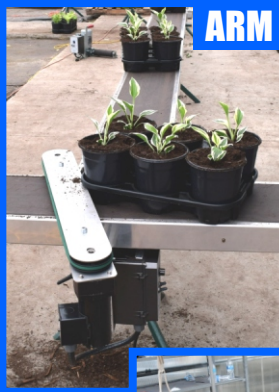
POWER DIVERTER ARM